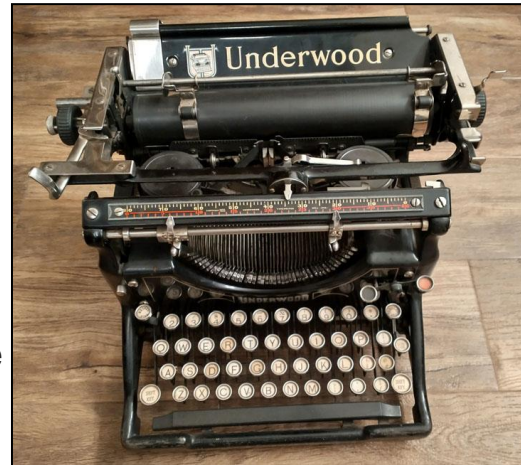
Underwood Model 5 typewriter – 1928 Niwot Historical Society, Arbuthnot Collection