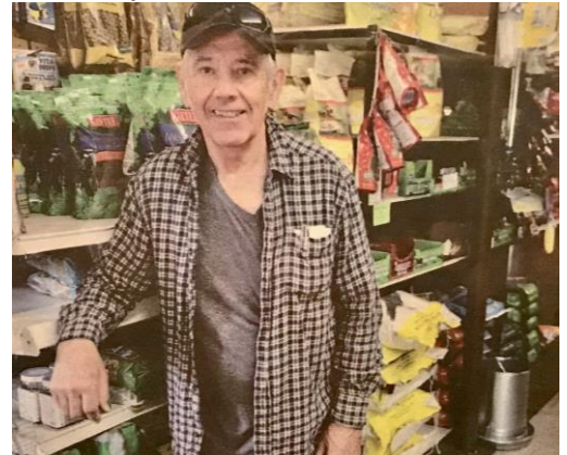
Photo: Steve Rollman in the Business Plus section of the Daily Camera, June 1, 2015