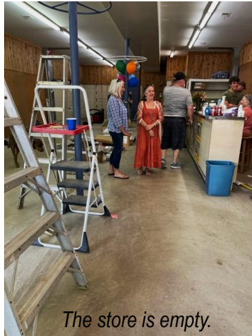
The store is empty.