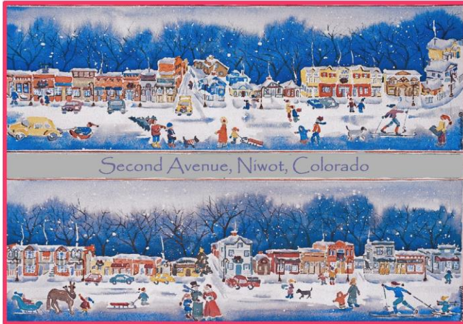
Second Avenue, Niwot

Or you can make arrangements to purchase with an email to: info@niwothistoricalsociety.org