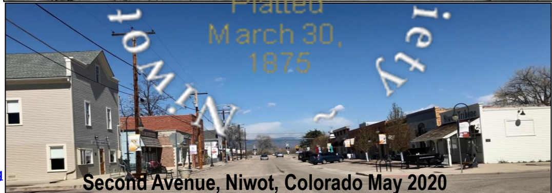
Second Avenue, Niwot, Colorado May 2020