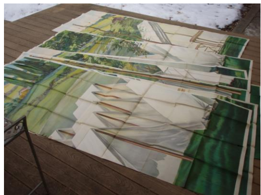
These panels were once used for plays by Left Hand Grange members. If you have more information on them, please let us know.