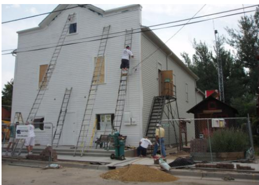
Our museum remains behind a chain link fence as workers complete their renovation of Left Hand Grange last summer.

Represented NHS at monthly Niwot Business Association meetings