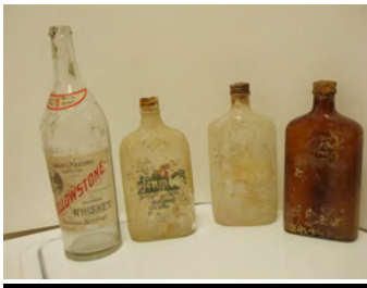
Blind Pig bottles

Also new to our artifact collection are four liquor bottles which were among many found under the Left Hand Grange floor during its renovation in 2009. The space apparently served as a speakeasy, or "blind pig", during Prohibition. Access was through a trap door on the first floor that over the years had been covered over.