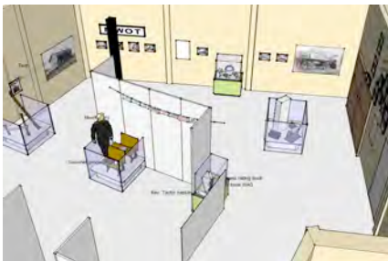
If you look closely at this artist's concept, you will see our school desks, depot sign and blacksmith shop doors.